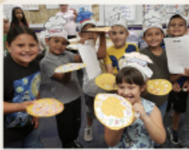
U.S. Grant Elementary