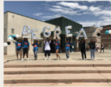
Grand Terrace High School