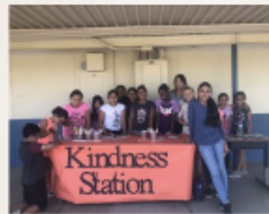
Ruth Grimes Elementary