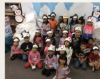
Alice Birney Elementary