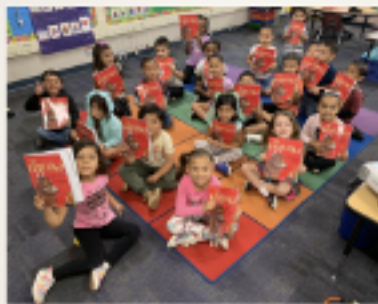
Cooley Ranch Elementary