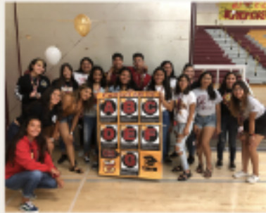
Colton High School